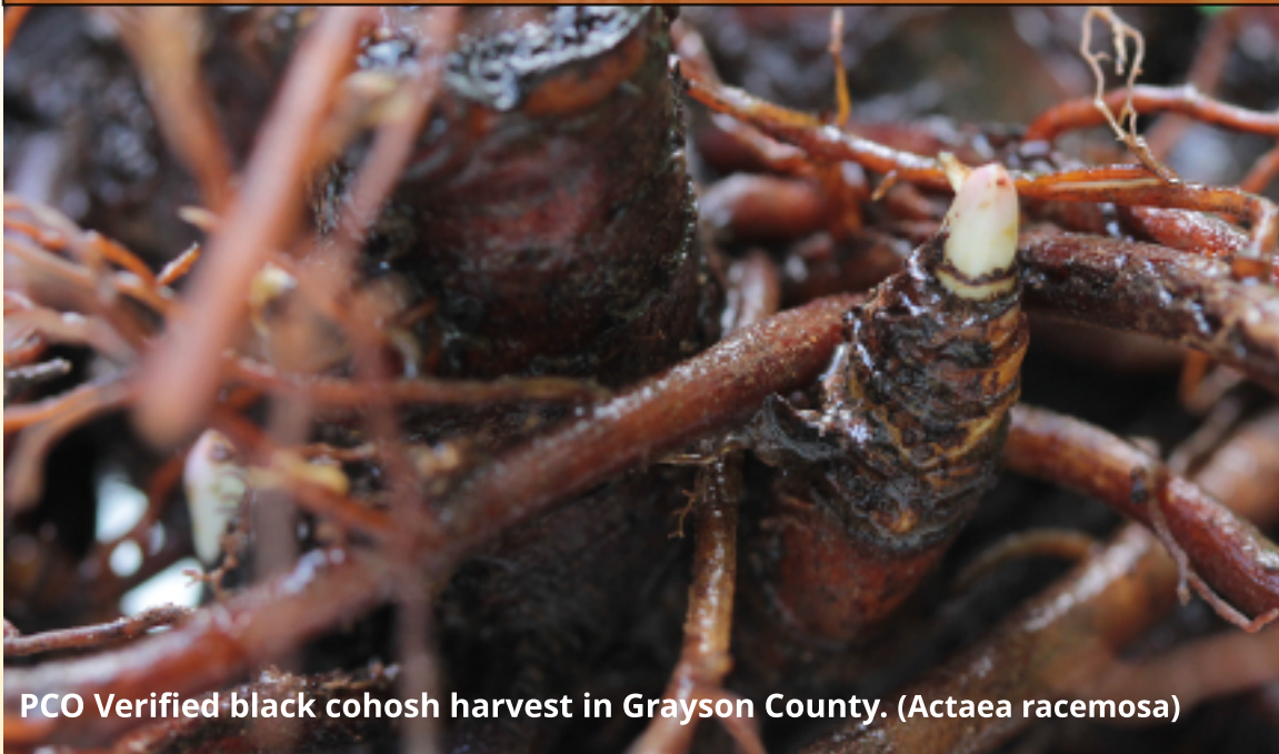
PCO Verified black cohosh harvest in Grayson County. ( Actaea racemosa )