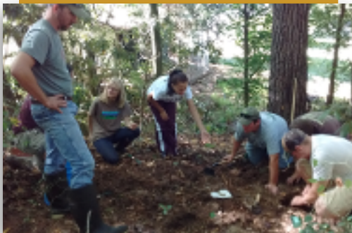
Drop Collaborative students plant a test plot of ginseng rootlets