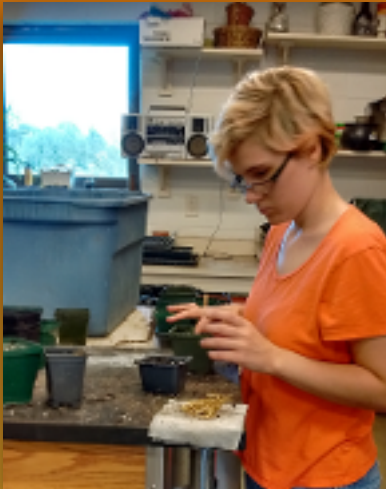
VHCC horticulture students pot up ginseng rootlets