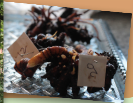
Black cohosh roots