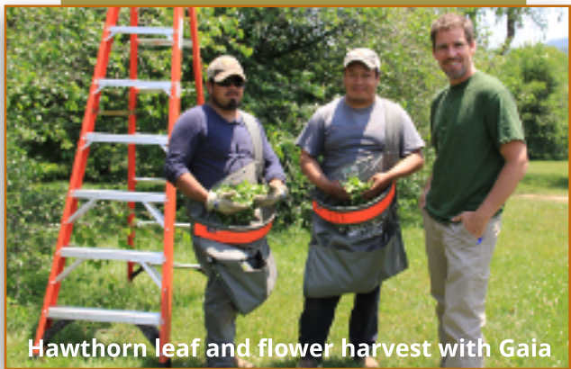
Hawthorn leaf and flower harvest with Gaia