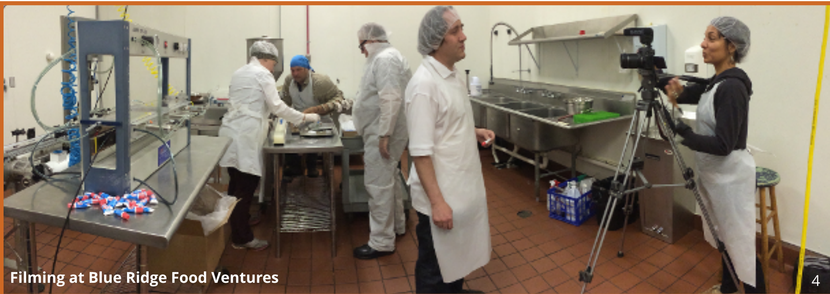
Filming at Blue Ridge Food Ventures