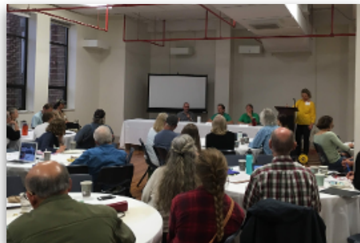
Panel of herb buyers, Forest Farmer Grower-Industry Expo

Appalachian Sustainable Development's work with forest farmers continues to grow. Through the Appalachian Harvest Herb Hub, they are working with the region's growers of forest botanicals to bring high quality, sustainably grown herbs to premier herb companies and apothecaries. This year, they are expanding capacity with a larger herb dryer and processing equipment to meet the demand for field and forest grown herbs.