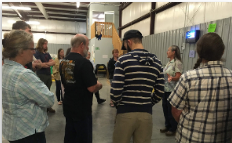
Field Day participants tour the Appalachian Harvest Herb Hub