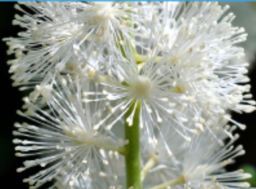
Black cohosh ( Actaea racemosa )